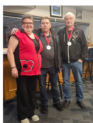
Pictured above: 1st Place Doubles Winners of #91 Prince Edward.