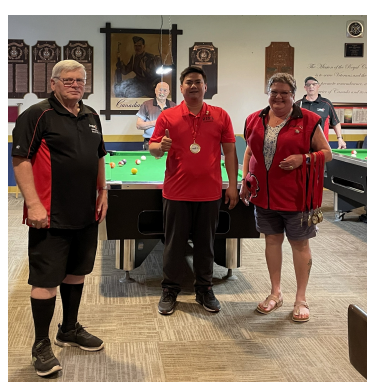
Pictured above: 1st Place Singles Winner of #7 Britannia.

Hosted by the Aldergrove Legion on April 24-26, 2026