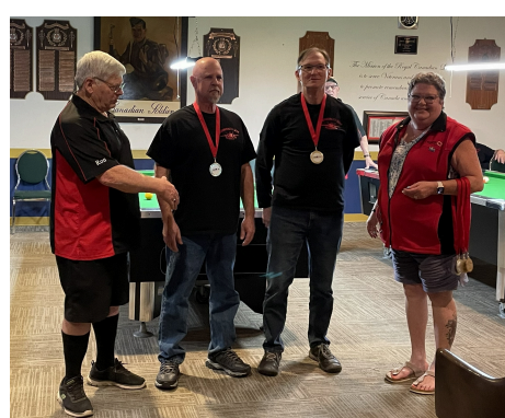
Pictured above: 1st Place Doubles Winners of #49 Mount Arrowsmith.