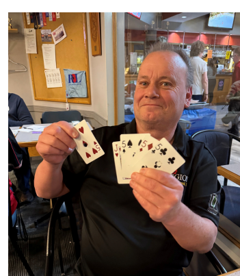
Pictured above: 1st Place Singles Winner of #24 Cranbrook.

Hosted by the Maple Ridge Legion on March 20-22, 2026