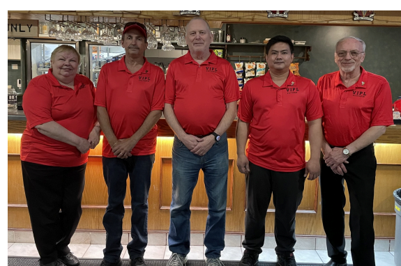
Pictured above: 1st Place Doubles Winners of #7 Britannia.