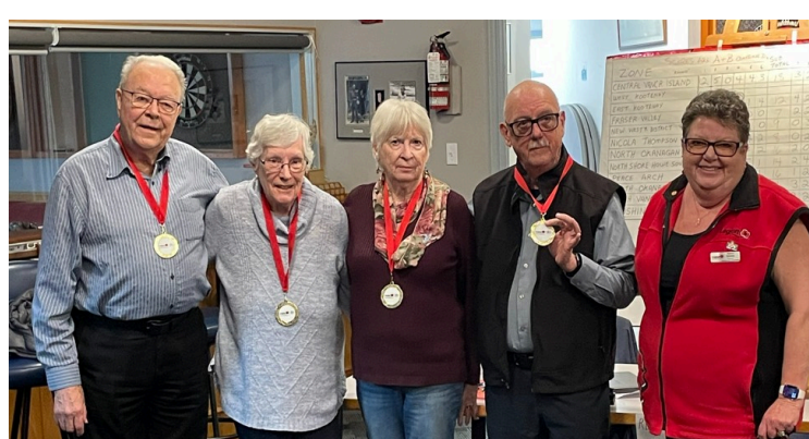
Pictured above: 1st Place Teams Winners of #171 Ladysmith.