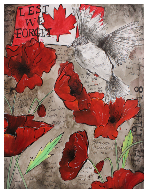
1st Place: Junior Colour Poster Ziyu Candice Li #60 West Vancouver