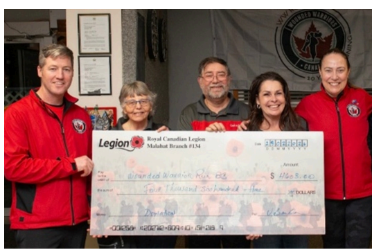
Pictured above: $4,603 donated to Wounded Warriors BC by the Malahat Legion.